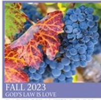
FALL 2023 GOD'S LAW IS LOVE PARTICIPANT'S BOOK